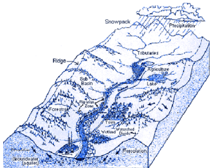
Produced by Lane Council of Governments

An area of land that drains to a common point. Watersheds come in all shapes and sizes. They cross county, state, and national boundaries. In the continental US, there are 2,110 watersheds.